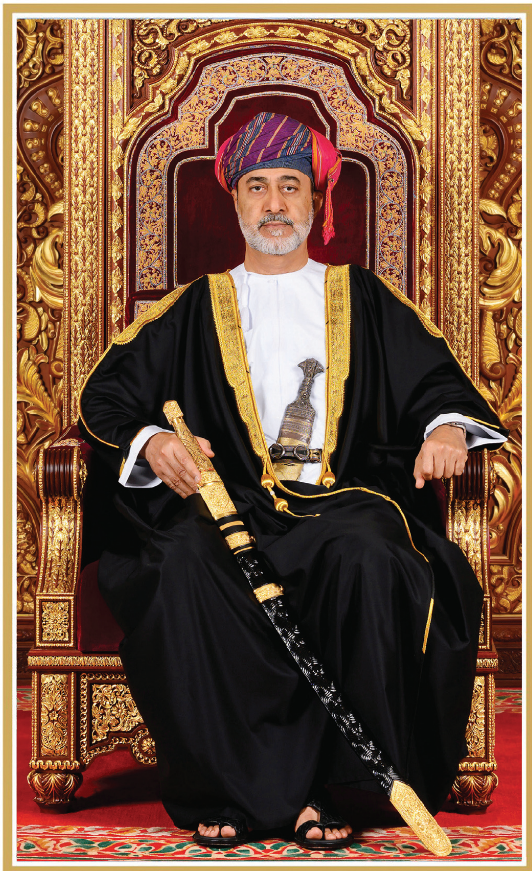
His Majesty Sultan Haitham Bin Tarik