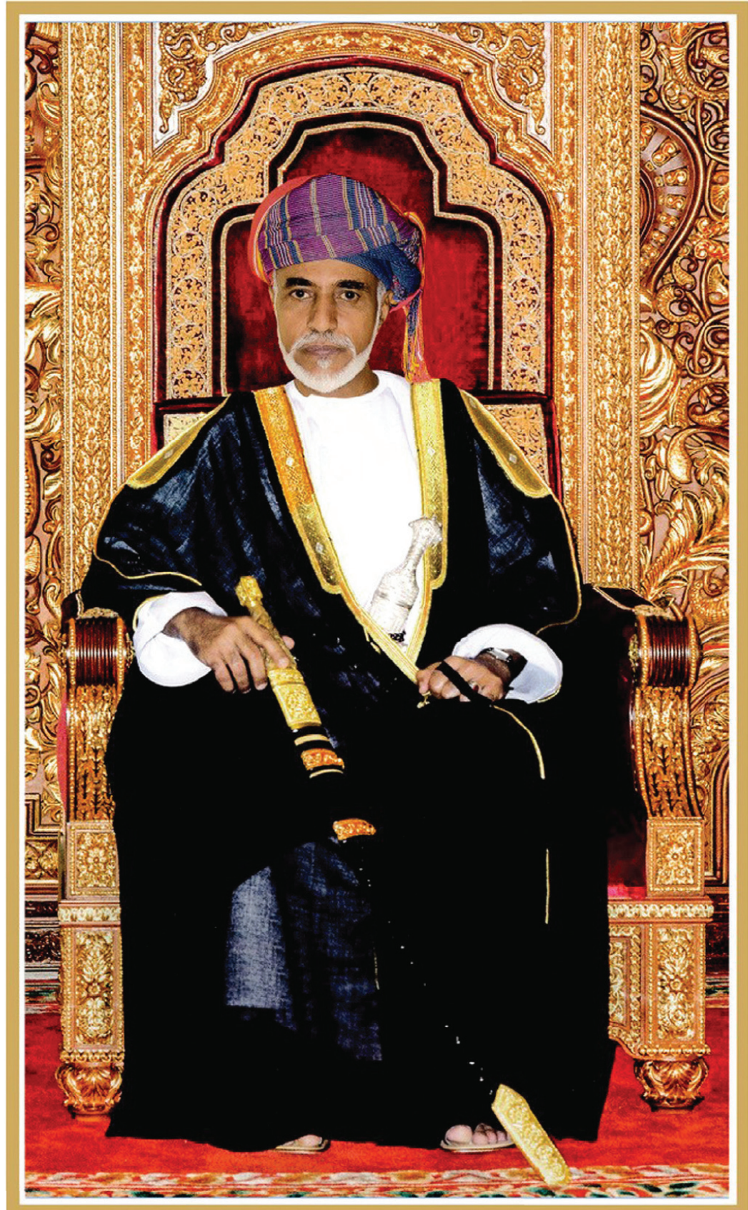
The Late Sultan Qaboos Bin Said