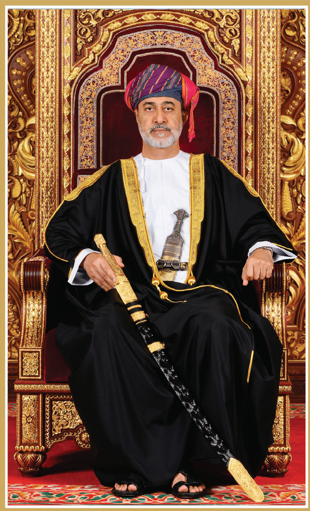
His Majesty Sultan Haitham Bin Tarik