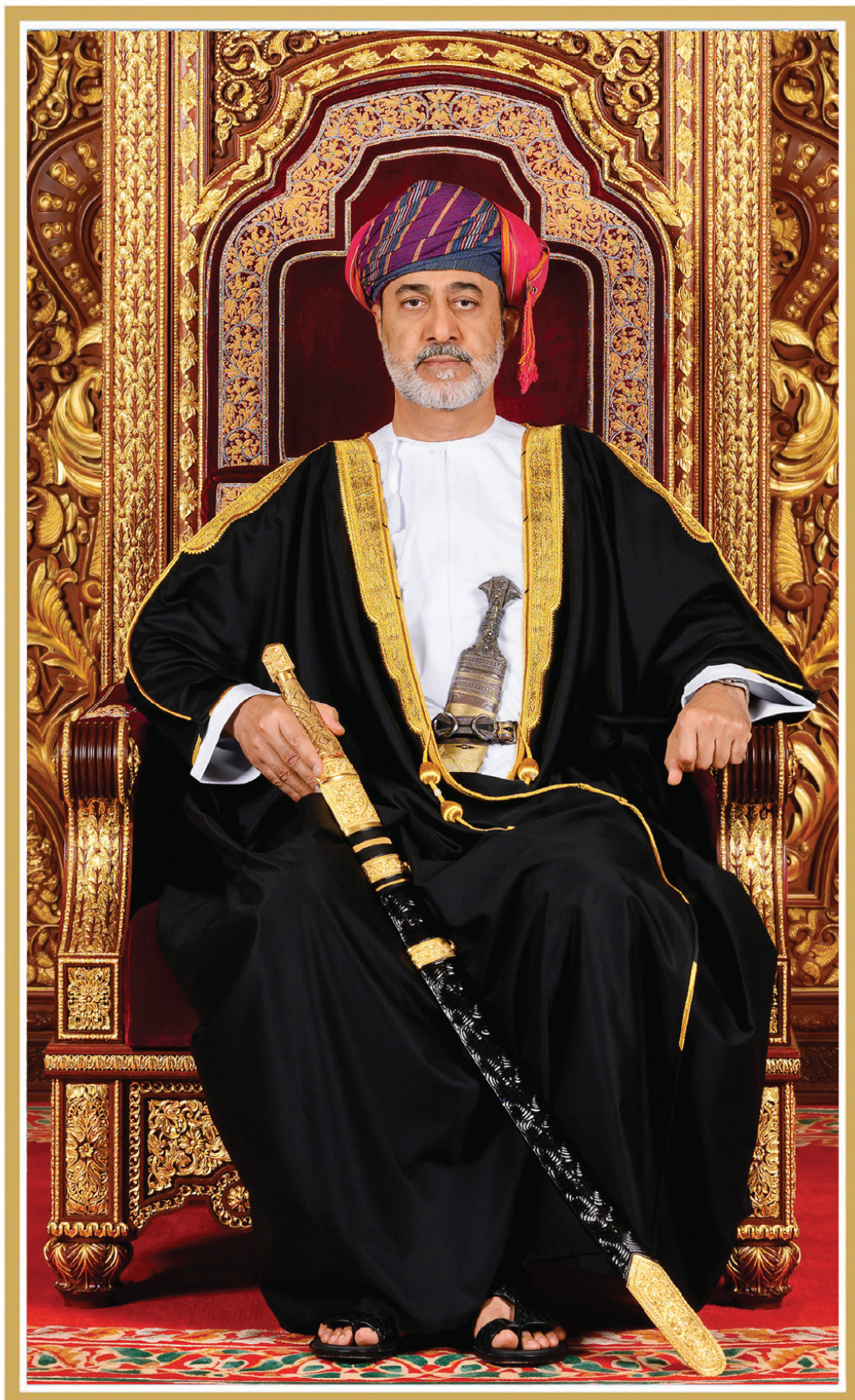
His Majesty Sultan Haitham Bin Tarik